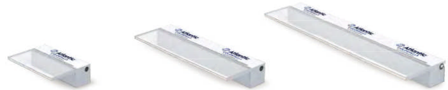
MODEL: CF12B (Ice Blue) CF12W (Crystal White) CF12SW (SOL White) MODEL: CF24B (Ice Blue) CF24W (Crystal White) CF24SW (SOL White) MODEL: CF36B (Ice Blue) CF36W (Crystal White) CF36SW (SOL White)